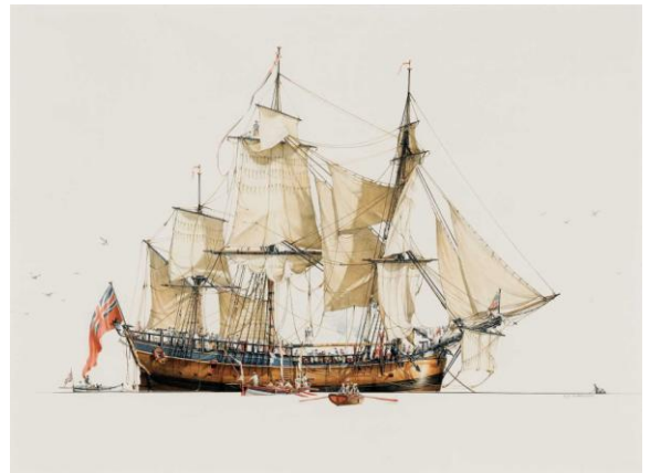
HM Bark Endeavour', watercolour by Ross Shardlow

The transformation of the bulk coal-carrying ship (collier) Earl of Pembroke , built at the industrial port of Whitby, England, into the exploration vessel HM Bark Endeavour was a costly, and some thought unwise choice when the ship was chosen to make a scientific journey to Tahiti in order to observe the Transit of the planet Venus across the Sun in June 1769. The Earl of Pembroke was purchased at a cost of £2800 and a further £5394 was spent on the hull, masts, yards, furniture and stores.