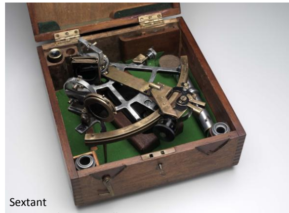
Sextant

Almost three years later, on 12 th July, 1771 this 32m long, 8.92m wide wooden ship dropped anchor in London. While Lieutenant Cook was promoted to Captain and Joseph Banks and Dr Solander were feted as celebrities; within a week of her return to England, the HM Bark Endeavour was refitted as a naval transport. She was then sold in 1775 and renamed the Lord Sandwich . After extensive repairs, in February 1776 the ship became a troop transport to carry soldiers to North America to help defeat the rebels during the American Revolution. Between 3 and 6 August, 1778 the Lord Sandwich , along with a fleet of old and surplus vessels, was scuttled in Newport Harbour in an attempt to blockade the harbour from the French ships carrying support for the revolutionaries.