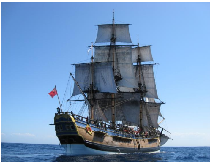
HMB Endeavour Replica was built from the plans of the original vessel

Sextants were navigational instruments developed in 1757, named because their arc is equal to one-sixth of a circle. Officers used them to measure vertical and horizontal angles at sea to calculate the ship's position.